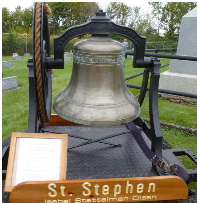
This bell once called worshipers to St. Stephen's Church.

2010 On September 12, the bell makes its return to St Stephen Cemetery - once again to toll