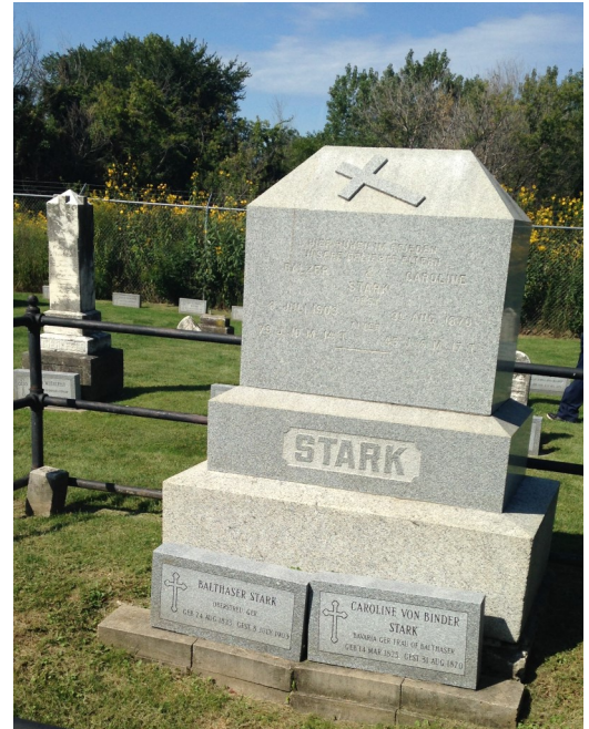
A Stark family monument at St. Stephen's Cemetery

A short religious ceremony and a few songs were sung by a singer and the group.